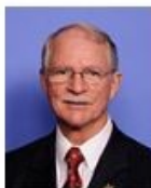
John H. Rutherford Republican Florida District 4