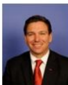
Ron DeSantis Republican Florida District 6